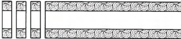
Make 2 strip units. Cut 36 segments 2-1/4" wide.

1. Join the 2-1/4" MEDIUM strips and the 4" LIGHT strips to make two strip units as shown. Press the seams toward the MEDIUM strips. The strip units should measure 7-1/2" wide (raw edge to raw edge) when sewn.