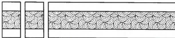
Make 2 strip units. Cut 18 segments 4" wide.

From these strip units, cut 36 segments 2-1/4" wide.