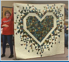
Penny's "Suitcase Show"