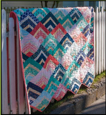
City Girl Chevron