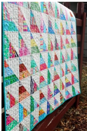
To the Point