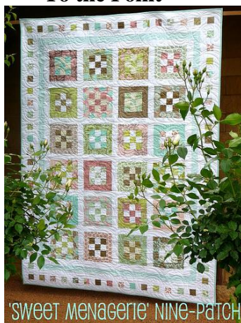
Sweet Menagerie Nine-Patch