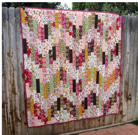
Playing the Scales