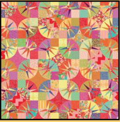
Laurie Sheldon's "Bright Lights Big City" (WIP)