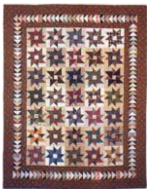
Labor Day Madness

In this workshop you will learn the easy and accurate sewing method for this very versatile unit. The combination unit has 3 triangles in it but we will make it without cutting any! By sewing first and then cutting we eliminate working with the bias. Pat will show you several great borders using these units. A handout will be given and discussed on how to make your pieced border fit your quilt top. Rated: easy to intermediate, not for a beginner.